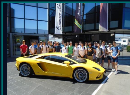
The Automotive Design and Engineering trip to Italy's Supercar valley was a huge success and is destined to become a regular trip for our students

Well done to our outgoing A-level students on securing places at top universities around the country including Sheffield, Loughborough, Liverpool and Bangor.