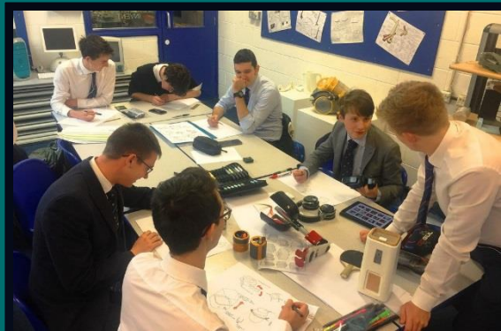
LRGS has been ranked 37 th in the country for STEM (Science, Technology, Engineering and Maths)