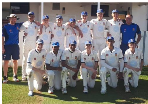
RGS Festival Champions