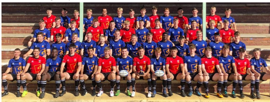
South Africa tour