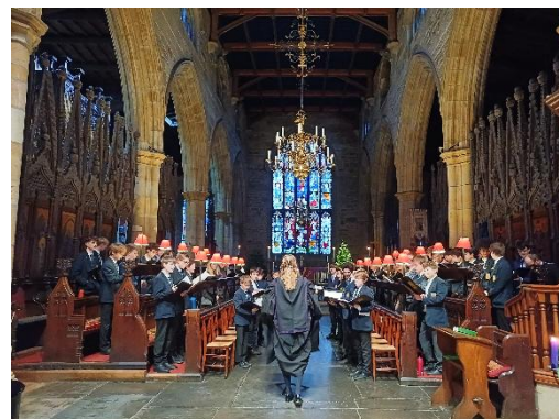
Festival of Nine Lessons and Carols

Best wishes to 48 pupils and staff on this week's Year 11 German trip . Good luck to Upper Sixth students waiting for news from interviews and applications!