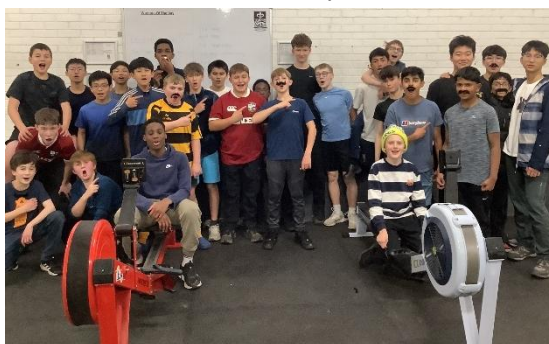
Storey House boarders – Row for Movember!