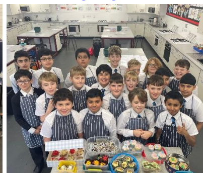
7R Food Tech