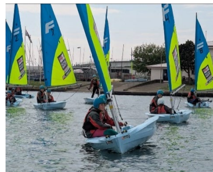
CCF Royal Naval section