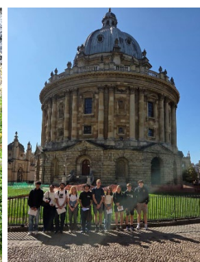
Oxford Open Day