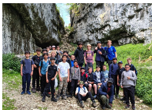
Year 7 geographers - Ingleborough