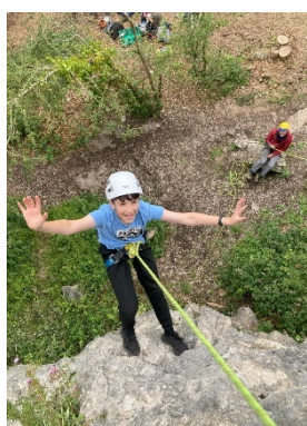
On the crag!