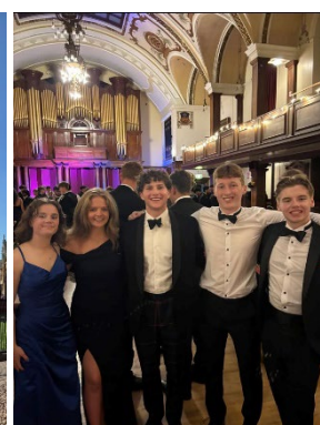
Leavers' Ball top team!