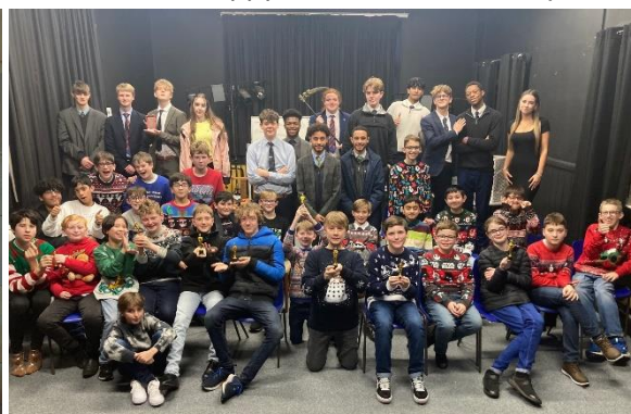
Christmas drama performances – cast and crew