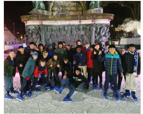
Storey House on ice

It is wonderful to end the term with the Festival of Nine Lessons and Carols in Lancaster Priory. Huge thanks to our musicians and readers.