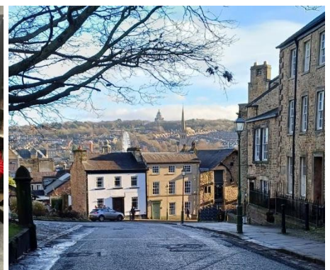
View from the original site of LRGs