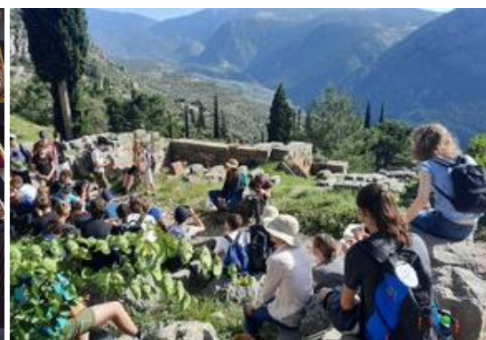
Sunshine for the Classics trip to Greece