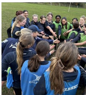
Sale Sharks coaching session