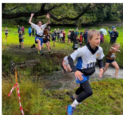
English Schools Fell Running