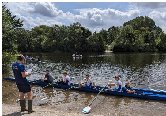
Last regatta of the year