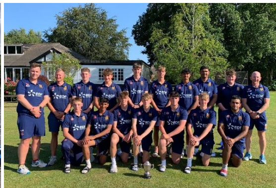
RGS Cricket Festival success