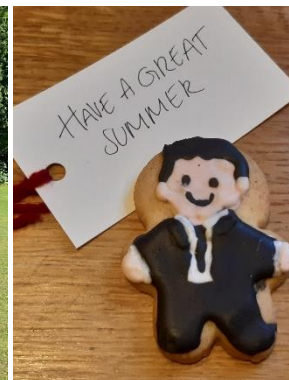
Have a great summer!

• 17 th August: A-level results • 24 th August: GCSE results • 4 th Sept: Year 7 & Lower Sixth • 5 th Sept: Term begins •