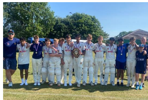
U15 County Champions

This phase of term is jam-packed with activities. Huge thanks to staff who ran the Year 7 outdoor residentials – some in sunshine, and some in rain! German students are now abroad on their exchange, and the next few days include Silver DofE expeditions, a rowing regatta, the Royal Grammar Schools' cricket festival in Colchester, and much more.