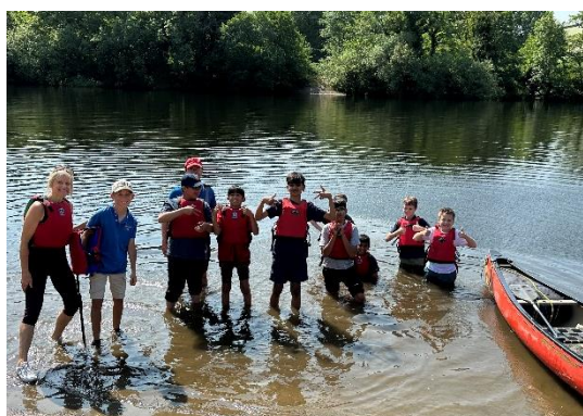
Year 7 outdoor residentials