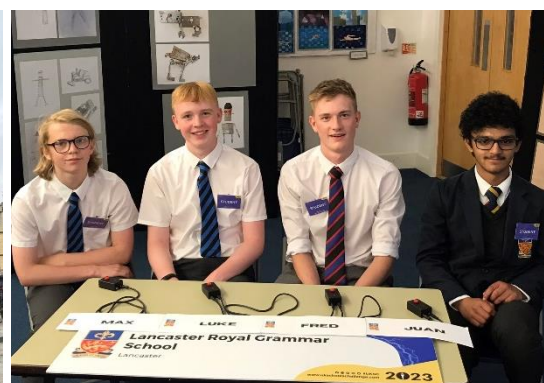
Senior Quiz Team