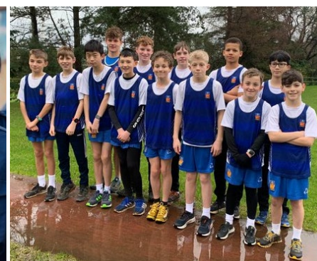
District Cross Country