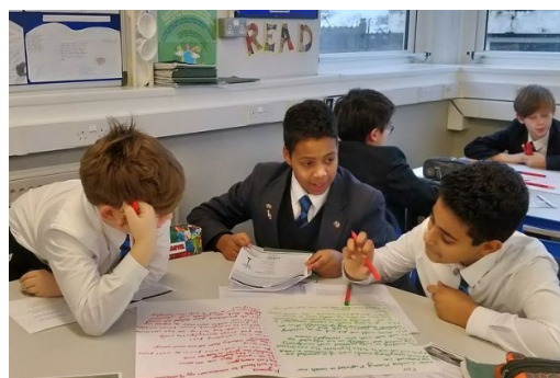
Year 7 Geography

I hope that 2023 will be an immensely positive and productive year in which your sons and daughters flourish.