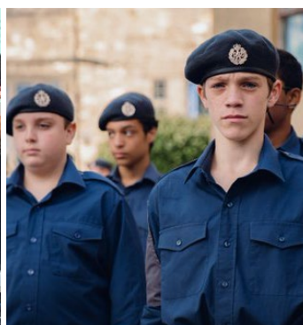
Combined Cadet Force