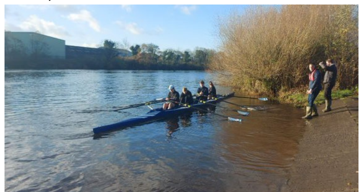
LRGS Boat Club – before the ice arrived!