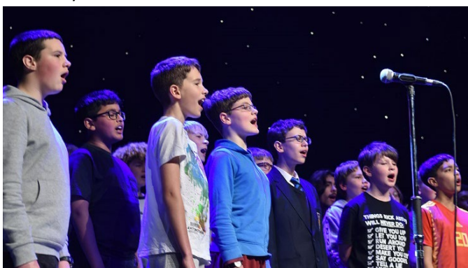
People’s choice – Lancashire Choir of the Year