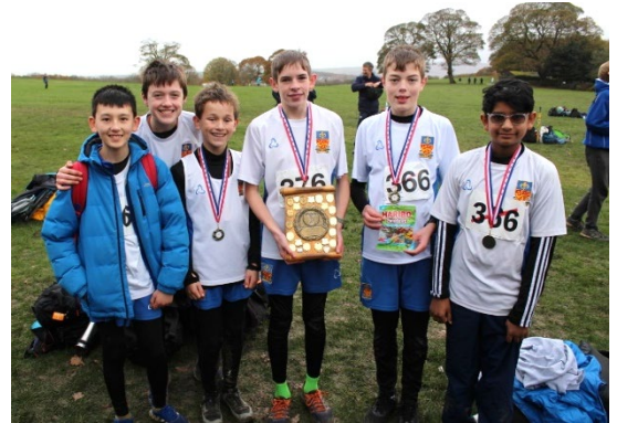
Yr 8 Orienteers – British Schools Champions

It was wonderful to gather for our Festival of Nine Lessons and Carols in Lancaster Priory. Thank you to musicians and readers!