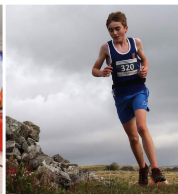
English Schools fell running