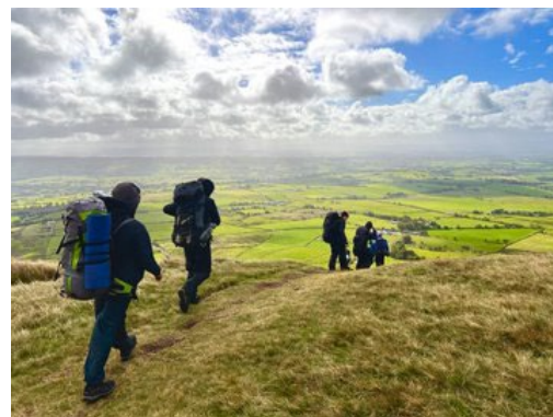
Duke of Edinburgh – Bronze