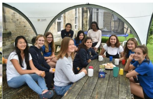
New pupils, day and boarding!